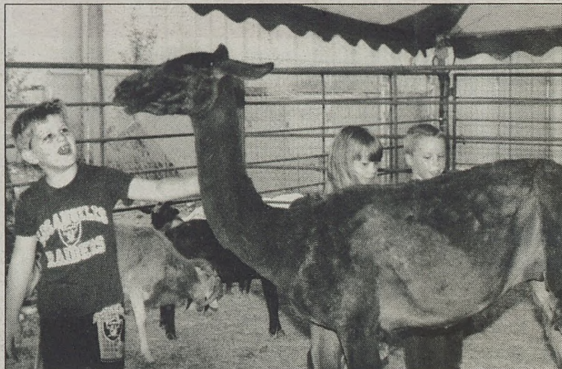
Young fair patrons will be able to interact with exotic animals including llamas and kangaroos at this year's fair.

Reservations are not necessary. Persons needing additional information should call School Day chairmen Evelyn Orange at 979-732-3341 or Pamela Potter at 979-732-2705.